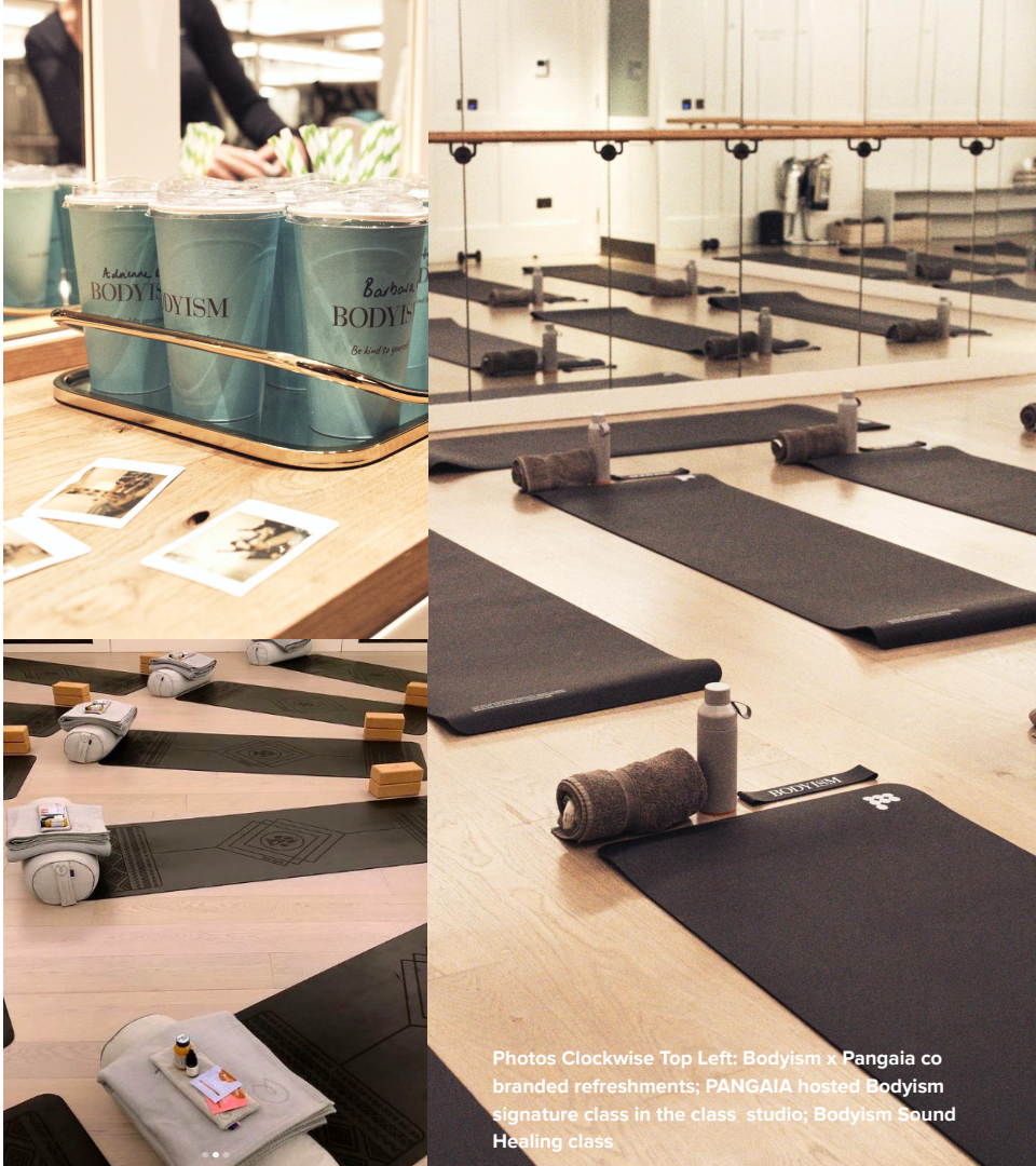
Photos Clockwise Top Left: Bodyism x Pangaia co branded refreshments; PANGAIA hosted Bodyism signature class in the class studio; Bodyism Sound Healing class

We can also create bespoke packages tailored to your event.