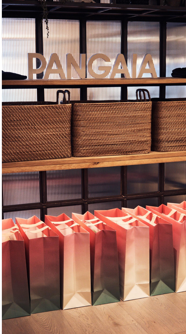
Photo: Goldfaden MD hosted a wellness talk at Bodyism to launch their new body care range featuring Bodyism beauty food in the gift bags; Fendi breakfast event, featuring Bodyism berry burn.

Our supplements come in a range of colours and functions to match your event colour palette and theme.